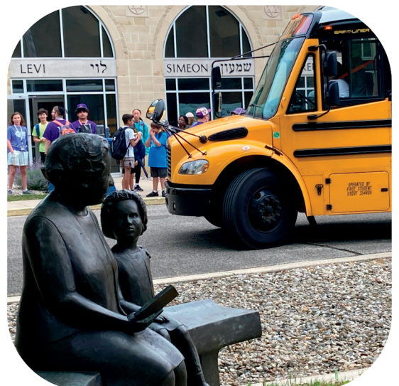
Berman-Brenner Family Sculpture Garden