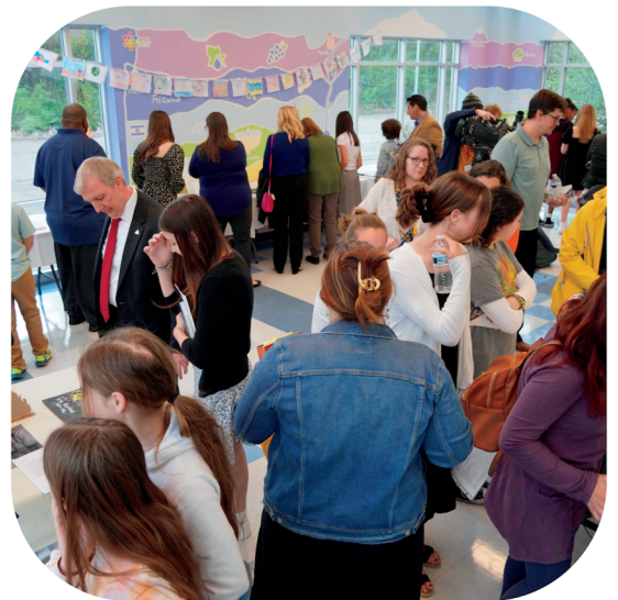
Yom Hashoah Student Art Exhibit