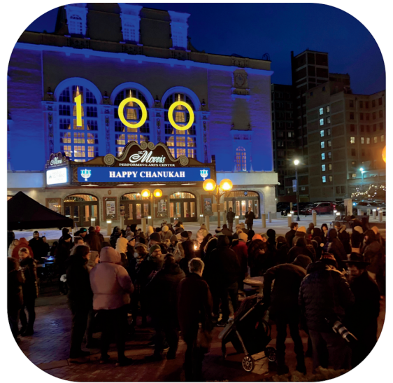
Downtown South Bend Hanukkiah Lighting